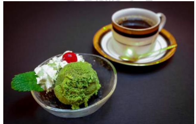
Matcha Ice Cream & Coffee 100% Organic Kona Coffee