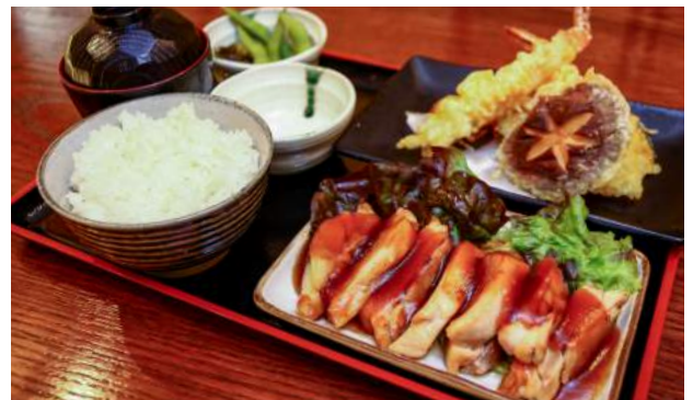
Teriyaki Chicken Thigh